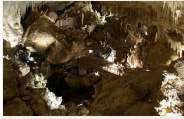
Mammoth Cave is an impressive, gothic-like cave that is home to ancient fossil remains. Explore at your own pace on a self-guided tour with MP3 audio headsets. Don't miss the Mam Walk and amazing wildflowers during spring. Located 15 minutes drive south of Margaret River on Caves Road.