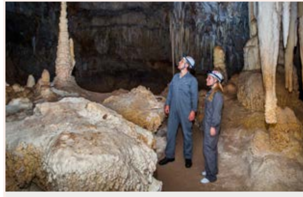
Moodyne Cave is a 3 hour exclusive caving experience that features some of the longest pinnacles found in the world. The 'tower of babel' and glistening array of formations leave visitors in awe. Tour departs from Jewel Cave.