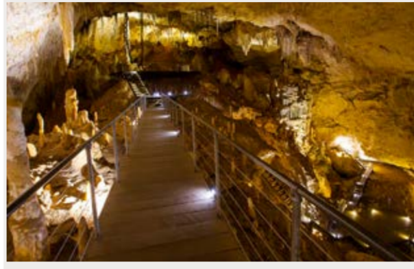
Jewel Cave is home to one of the longest straw stalactites found in any tourist cave in the world. The Preservation Centre includes interpretive displays and a stunning cafe overlooking the forest. Don't miss the Karri Walk. Located 10 minutes drive north of Augusta on Caves Road