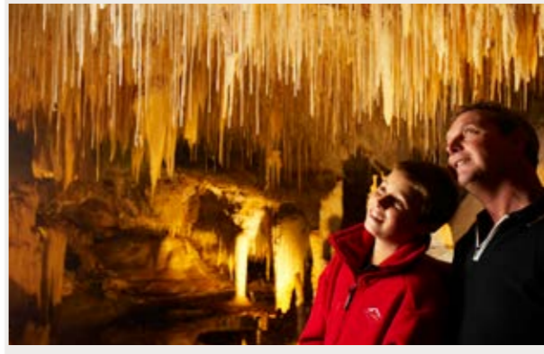
Lake Cave is a stunning crystal wonderland of timeless beauty. Within the cave a tranquil lake reflects delicate formations that will take your breath away. Lake Cave Et Caweworks Interpretive Centre are Located 17 minutes drive south of Margaret River on Caves Road.

08 9758 7316 08 9758 1944 08 9758 0002 08 9757 2266 08 9780 5255 08 9757 9222 08 6218 9444 08 9791 9197 n/a 0419 749 248 08 9757 2202 0427 088 601 08 9755 1615 08 9758 7316 08 9752 5555 0488 964 352 08 9751 1122 08 9727 3737 08 9757 3806 0416 936 194 08 9757 4066 08 9757 4066 08 9757 9095 08 9757 9627 08 9757 3444 08 9757 9330 0419 947 594 08 9752 2222 08 9757 0200 08 9757 3733 08 9757 3751 08 9754 8555 0417 173 901 08 9757 2163 08 9758 1055 08 9757 3111 08 9284 3355