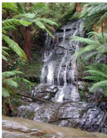
Cyathea Falls, Tarra Valley

Meander through a rainforest gully and across trickling mountain streams to Cyathea Falls. The ancient Myrtle Beech along the trail creates a protective canopy above a delicate understorey of tree ferns, lichens and moss.